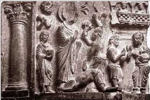
Dipankar Buddha, Pakistan

Traditionally it is held that 'Buddha' signifies one who has attained enlightenment after perfecting the 10 paramis , viz., dana (charity), sila (right-conduct), metta (loving compassion), panna (wisdom) and so on. Before the attainment of such perfections one is called a ' Bodhisatta '. (Dr Ambedkar sought to achieve the perfection of wisdom hence he showed special fascination for the epithet 'Bodhisatta').