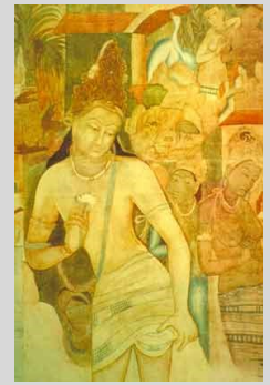
Bodhisattva Vajrapani & Padmapan Ajanta, India

There are 4 popular uses of the term Buddha: